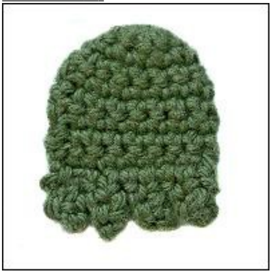
Arm (make 2) color: green