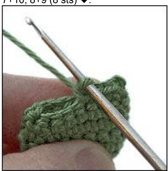
Row 2: turn the work and crochet a ch *in the first stitch you make 1 sc, then crochet 2ch and now work 2sc back (look arrows at the image ♥) in next stitch make 1 sc*

turn the work and crochet a ch to close the foot you have to work one single crochet over two single crochets: 1+16, 2+15, 3+14, 4+13, 5+12, 6+11, 7+10, 8+9 (8 sts) ♥ :