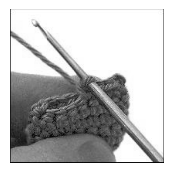
work in the toes: