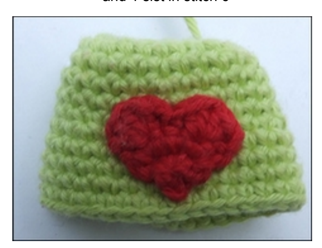
finish: fasten off and sew with the end of yarn the heart on the shirt

4 half double crochet in st 2. 1 slst in st 3, 4 half double crochet in st 5 and 1 slst in stitch 6