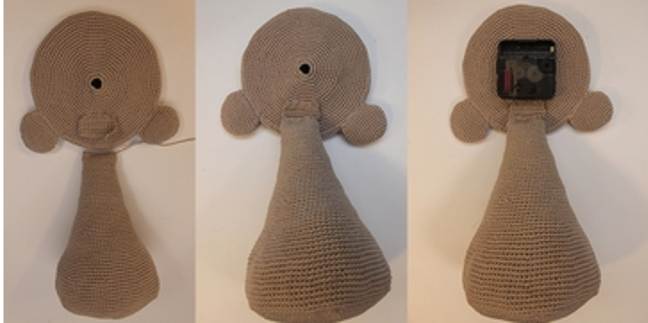
Example picture: show you another figure and is only for illustration

Following the clockwork has to install – Note: Pointers are fixed at the end